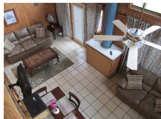
2-story A-frame Cabin at Big Creek Water Park, Soso, MS