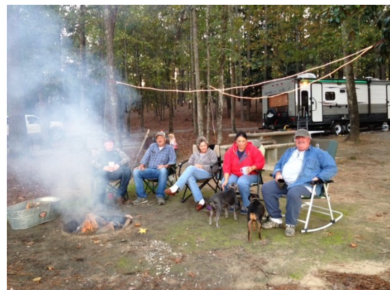
Nothing like sharing a campfire with friends.