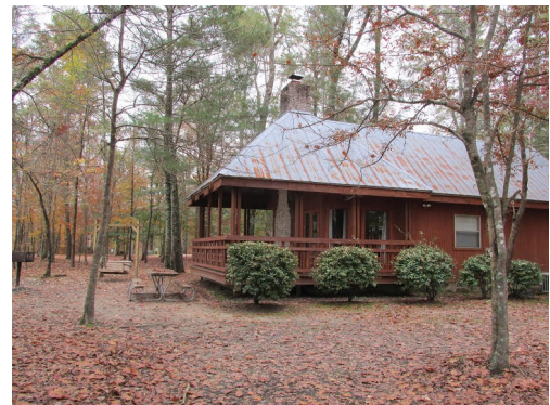
Millenium cabin at Maynor Creek in Waynesboro, MS