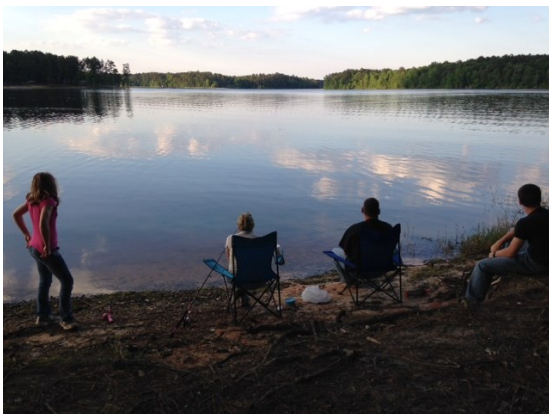
Enjoying a relaxing afternoon fishing.

Here at Maynor Creek we have so much to be thankful for. We have struggled with personnel, but now have a team that works well together. We had a very busy summer and looking forward to having a better summer in 2016. During Thanksgiving holiday week our campsites and cabins were full. Everyone came together to enjoy their family and friends. The weather was perfect; not too cool. As the year ends we're excited to see what the new year brings. Merry Christmas and Happy New Year!